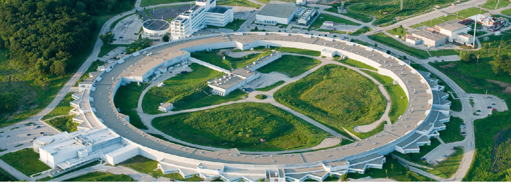
Aerial view Advanced Photon System, Argonne National Laboratory.