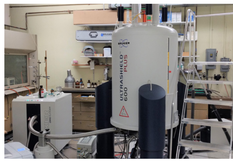
Nuclear Magnetic Resonance Facility at the University of Toledo.